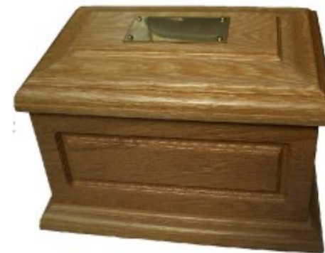
with Solid Oak Casket £225