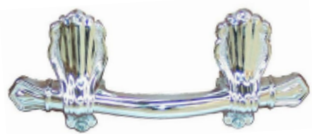
Set of Three Cast Metal Nickel Finished Doric Handles