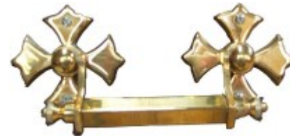
Set of Solid Brass Handles