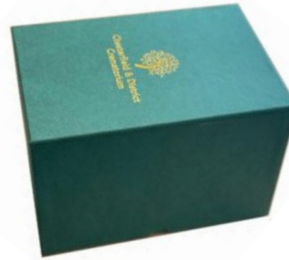
with Crematorium Box £65