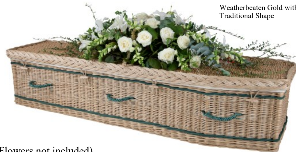
Weatherbeaten Gold with Green Traditional Shape