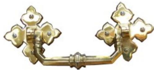
Set of Antique, Solid Brass Gothic Handles