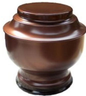
with Metal Spun Urn £195