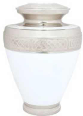
with Brass "Marble White" Urn £310