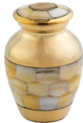
with Mosaic Urn £310