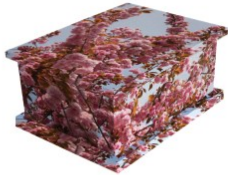
with Spring Blossom Casket £310