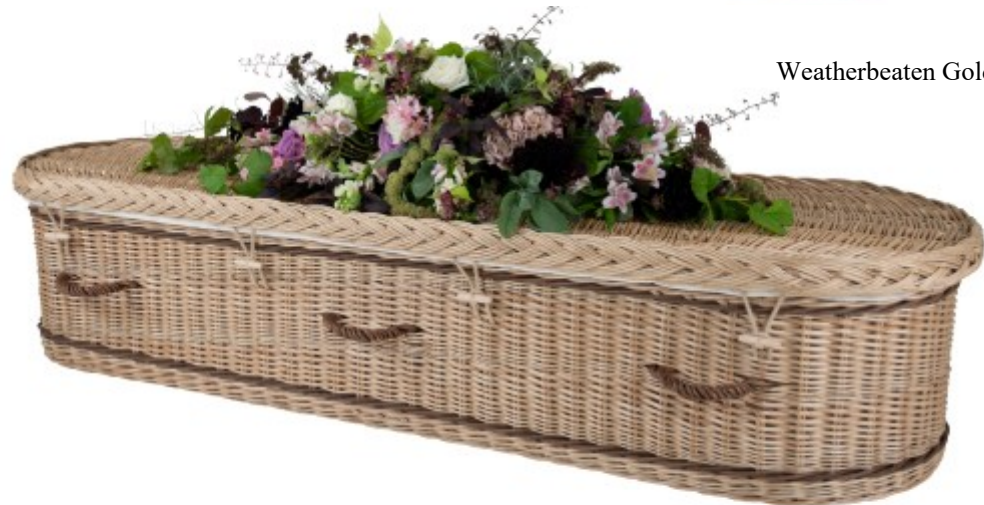
Weatherbeaten Gold with Brown