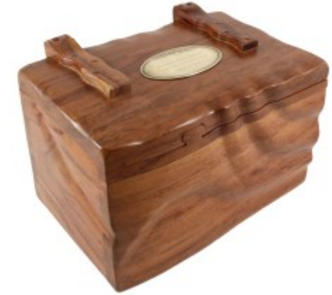
with Solid Wood "Trent" Urn £305