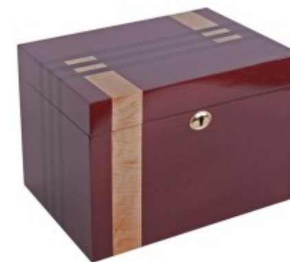
with Inlaid Wooden "Azure" Casket £295