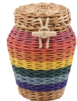
with Round Rainbow Willow Urn Handmade In Somerset £245

Our Prices Include for the Collection/Receiving of the Ashes, for taking responsibility for them and for storage on our premises for up to thirty days Subject to availability