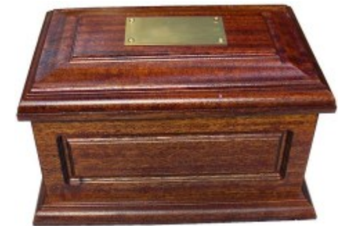
with Solid Mahogany Casket £225