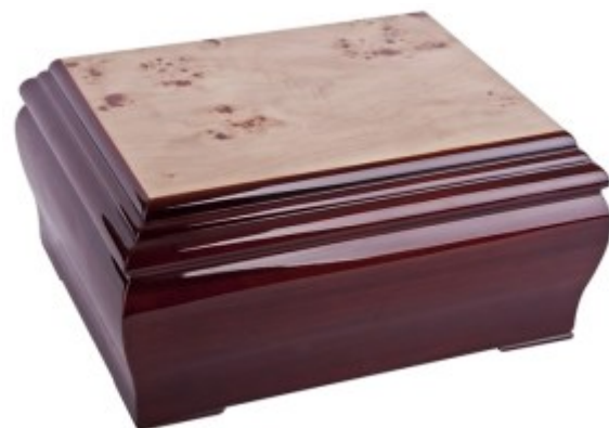
with Continental Casket £265