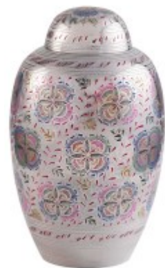
with "Grace" Urn £310