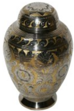
with Ambassador Urn £320