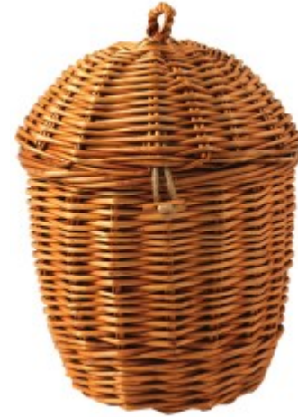
with Round Oasis Willow Urn £195