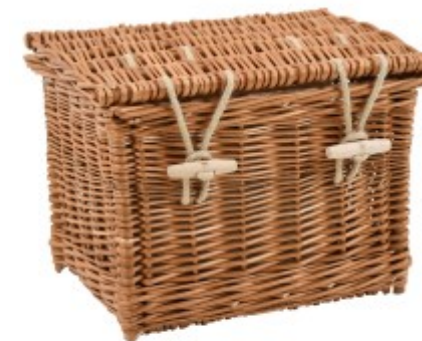
with Buff Willow Casket Handmade In Somerset £245