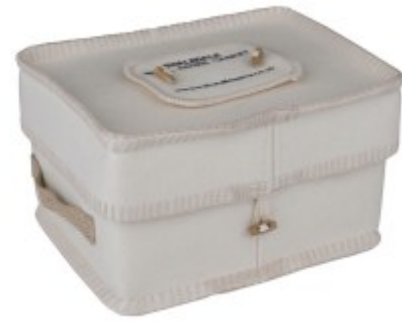
with White Woollen Urn £255