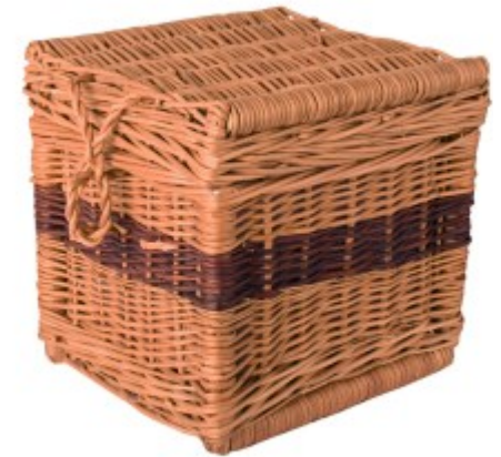
with Oasis Willow Casket £195