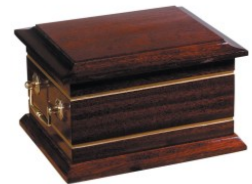
with Solid Wood "Lesbury" Urn £310

Our Prices Include for the Collection/Receiving of the Ashes, for taking responsibility for them and for storage on our premises for up to thirty days Subject to availability