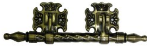
Set of Three Antique Brass Bar Handles, and T-ends