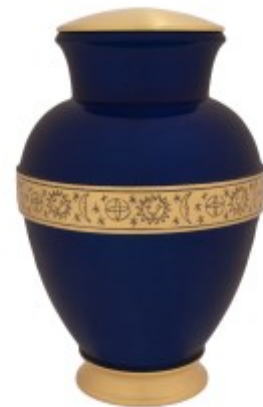
with Blue Harvest, Metal Urn £375