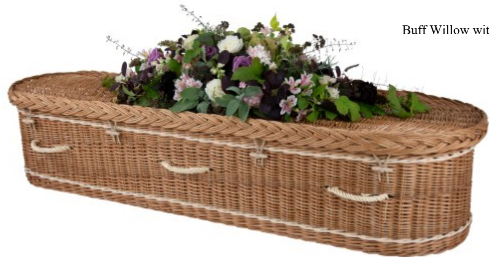
Buff Willow with Cream