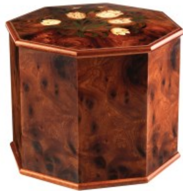
with Florence Urn £685