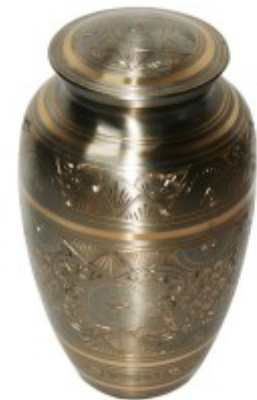
with "Sovereign" urn £305