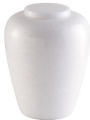
with "Simply Marble" Urn £310