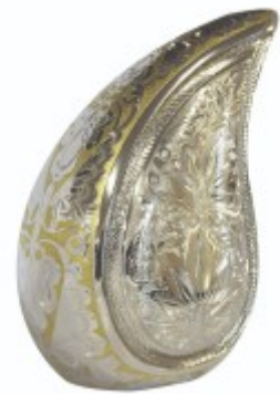
with Teardrop Patterned Urn £405 Inc. Keepsake - £495