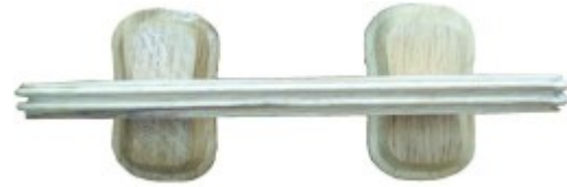
Set of Three Oak Bar Handles, and T-ends